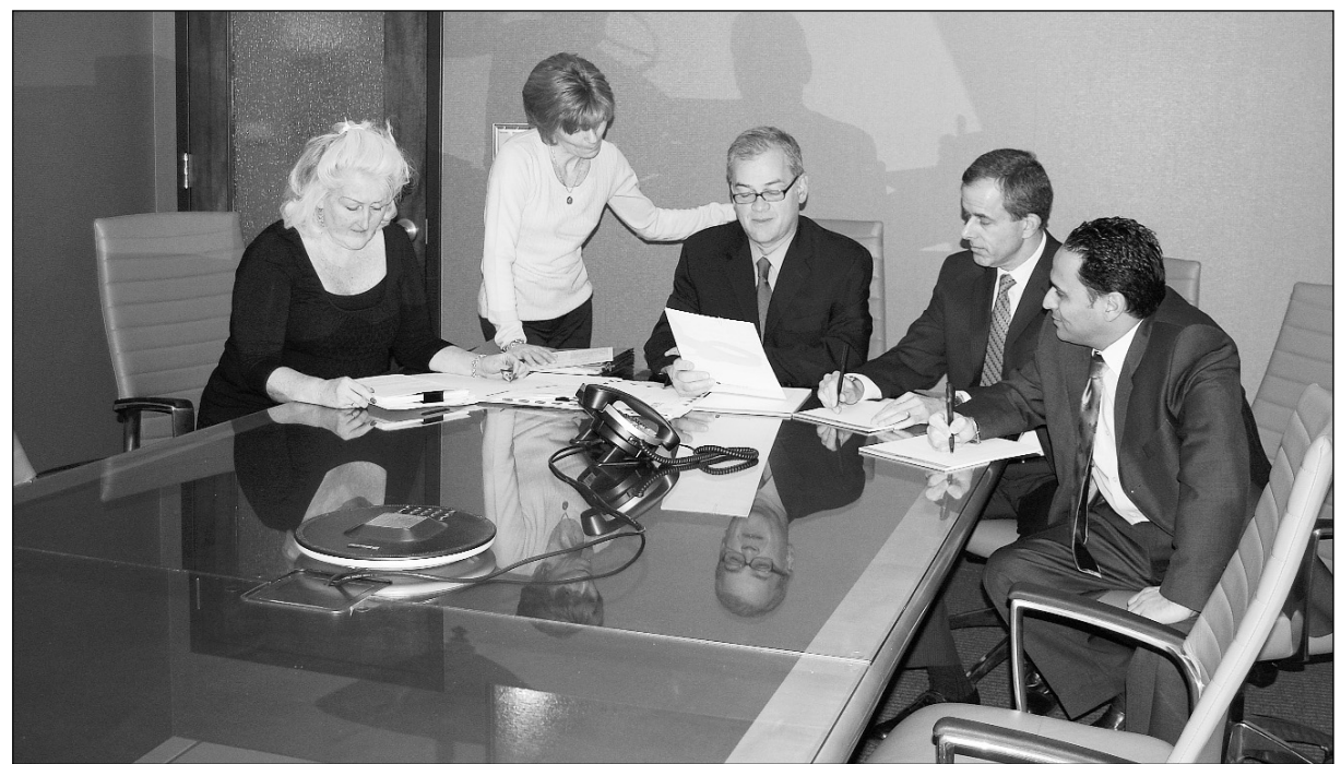
State of the art databases enable Vishnick McGovern Milizio LLP to address all of the client's legal needs and offer expert counsel at affordable fees.